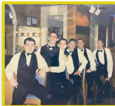
The Gilbert School prom in 1998