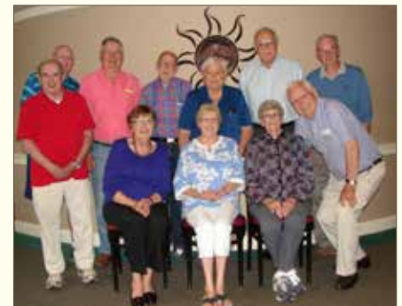
Class of 1955, 2017 Reunion Luncheon

What might be some of the other reasons that prompt one to consider