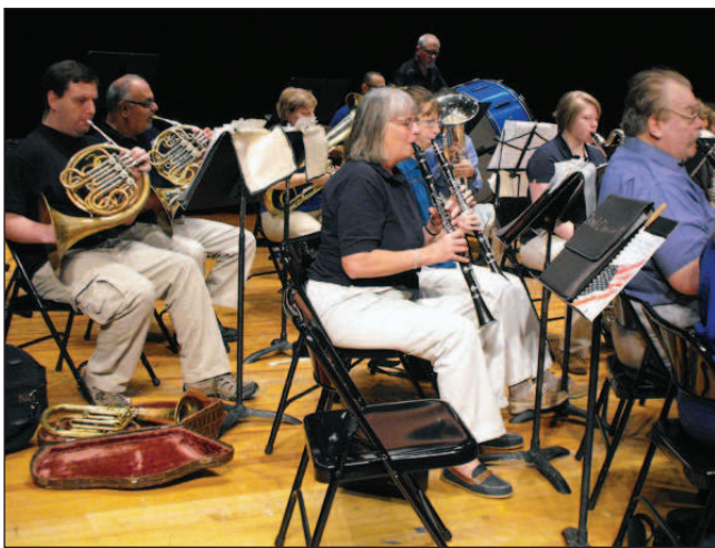
Members of the Gilbert Alumni Band and the Farmington Valley Band played to great acclaim during the distinguished alumni award ceremony.