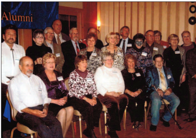
The classes posed for a group picture