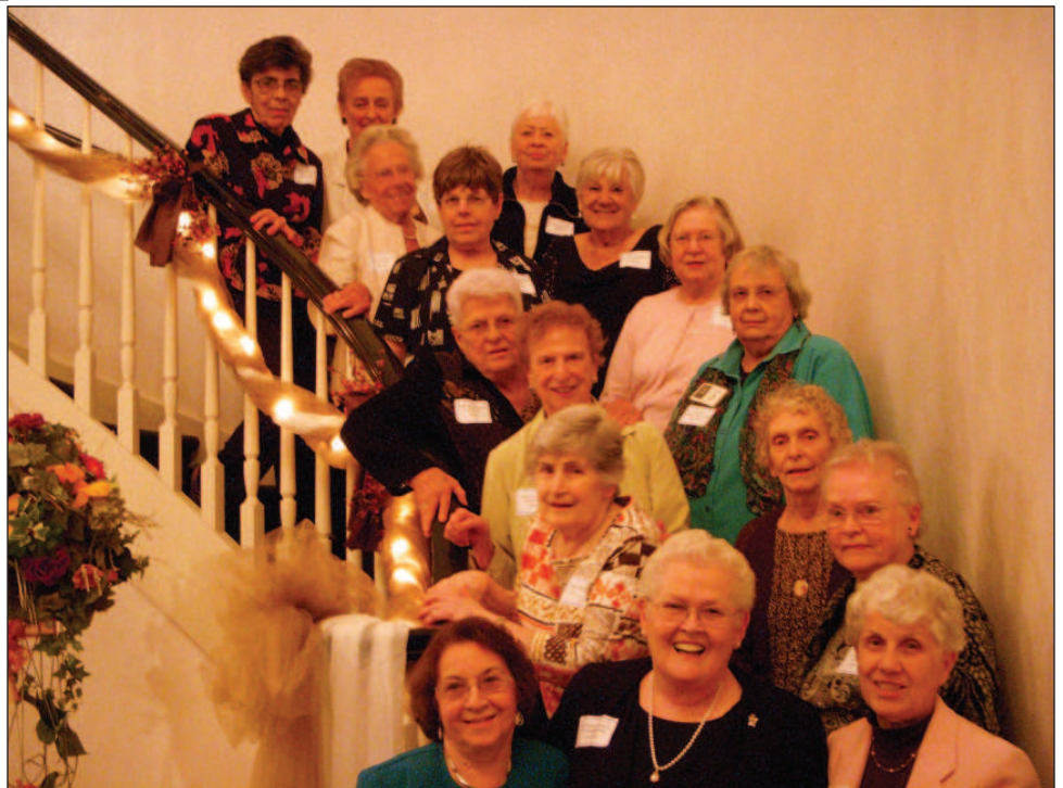
The class posed for a group picture.